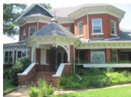
Griffin Award, Preservation