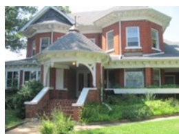
Griffin Award, Preservation